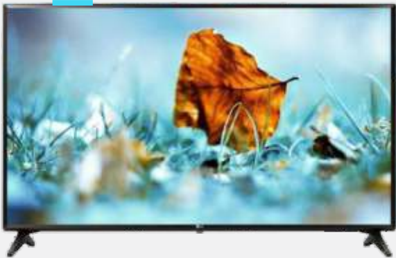
Manufacture LED Tv