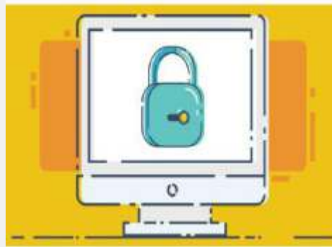
LED Finance Locker